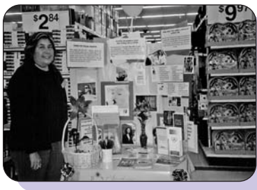
ARC booth at Wal-Mart Women's Health Fair

In 2005, we hosted five booths reaching 730 individuals with information about substance abuse and addiction. 180 press releases were issued resulting in 50 published newspaper articles and one television interview, twenty-six radio spots aired, 1,466 Advocate newsletters and 6,642 other pieces of literature were distributed.