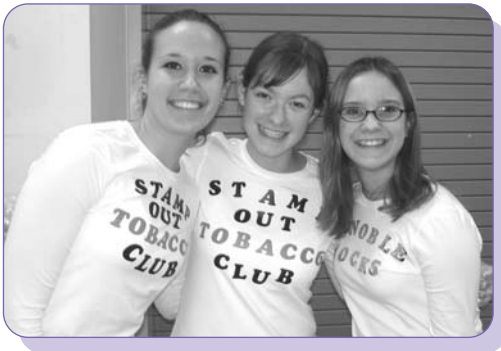
Radio Disney Stamp Out Tobacco Street Jam youth volunteers